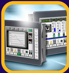
Touchscreens/ Operator Displays.