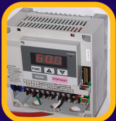
Motor Drives (VFD)

We perform component level board repair in addition to repairing the following: