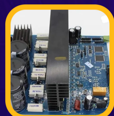
Machine Power & Operational Card.

We can repair some of the most popular manufacturers: